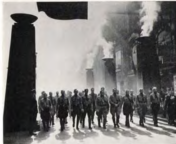
Procession in Munich, in Commemoration of November 9, 1923

There were temporary working coalitions with other associations but they lasted only for a short time. In these cases Hitler's