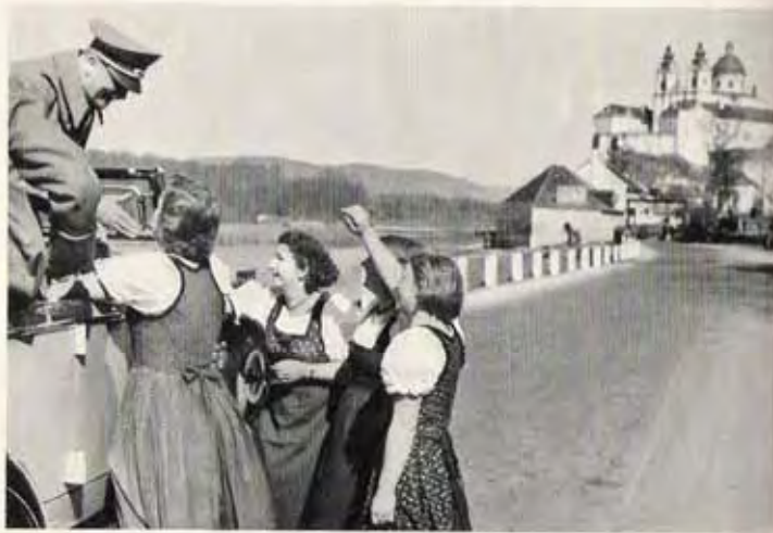
Hitler on his way to Vienna, March 12, 1938

requirements Hitler is extremely modest. He does not eat meat or take any alcoholic drinks; nor does he smoke. This is simply because he feels it suits his health better to be abstemious in regard to these things.