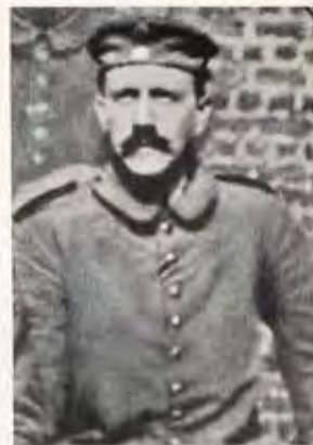
The Nameless Soldier

Though the years spent in Vienna meant a hard and bitter struggle with life, the experience gained in this school was of inestimable value afterwards. Hitler was now yearning to live as a German in Germany itself, free from the oppression under which the German element had to suffer in that potpourri of nations which made up the Habsburg Empire. So he left Vienna and came to live in Munich. That was on April 24, 1912.