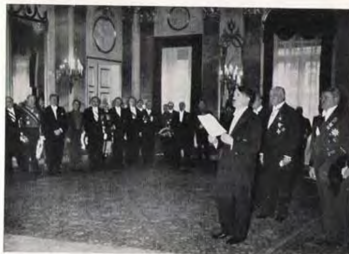
New Year Reception of Foreign Ambassadors

of Germany. On the occasion of the Party Congress in 1929 well over 100,000 persons made a pilgrimage to the old imperial city. Twenty-four new standards were presented to the S. A. following a solemn commemoration service for the dead at the War Monument in the Luitpoldhain. The march-past of the S. A. at the close of the ceremony, when Hitler took the salute, lasted close on four hours and formed an imposing demonstration.