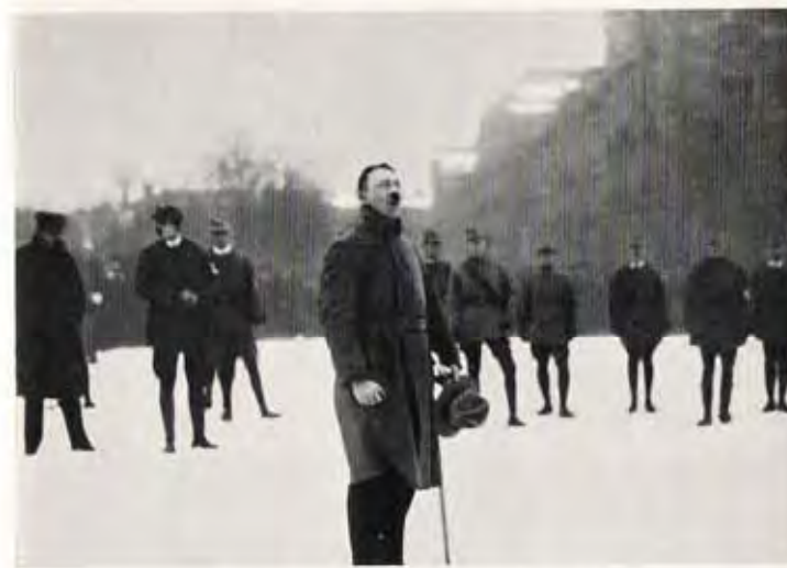
"On January 28, 1923, the first National Socialist Party Congress was held on the Marsfeld in Munich . . ."

The process of doing so went forward very slowly. The first meeting was composed only of the original seven members, with one or two onlookers. So meagre were the propaganda resources that the number of people who attended subsequent meetings increased only to 11, 13, 17, 23 and 34 respectively. At the meeting after that 111 persons were present. Hitler now spoke regularly at meetings and in that way became conscious of his oratorical gifts. He induced the committee to entrust the