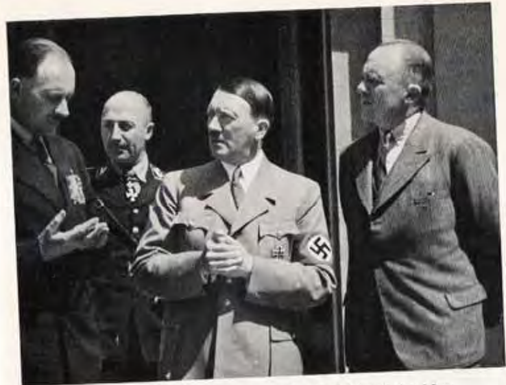
Hitler speaks with a Delegation of British Ex-Service Men

As the President's regular period of office was nearing its end a step was taken which brought Hitler into the foreground in negotiations with certain persons in the Reich Government. Chancellor Brüning endeavoured to get Hitler to consent to