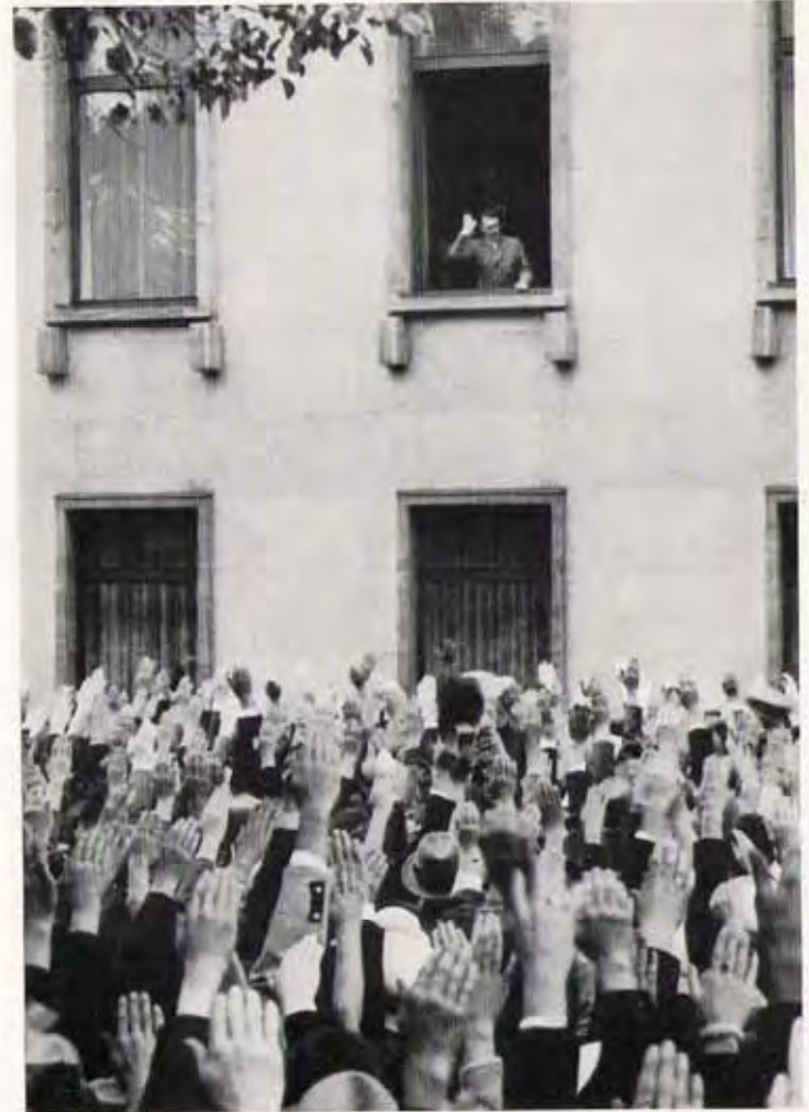
THE FÜHRER AT THE WINDOW OF THE REICH CHANCELLERY, 1934

Hitler took upon himself the full and sole responsibility for everything that had happened. Speaking in his own defence he stated in the course of a brilliant speech that the overthrow of Marxism was his aim but that this was considered essentially as a necessary pre-condition for the establishment of German