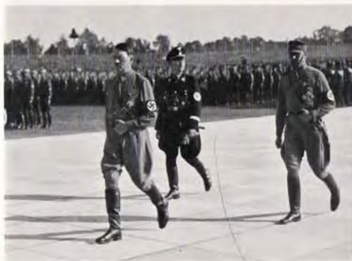
Reich Party Congress Nürnberg, 1936

And now a difficult and trying period set in for the young movement. In the first place it had no business headquarters of its own and not even a typewriter, to say nothing of being