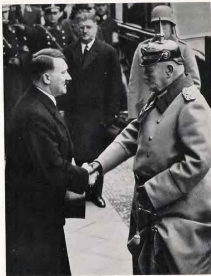
THE LATE PRESIDENT VON HINDENBURG AND ADOLF HITLER IN 1934

Towards morning it was repeatedly rumoured that Kahr, Lossow and Seisser had withdrawn from the new Government. As a matter of fact they were prisoners in the hands of the army generals who were deputizing for Lossow. Entirely on their own