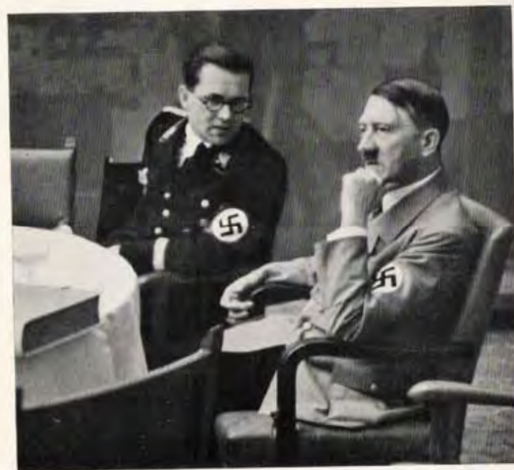
Adolf Hitler and Philipp Bouhler, the author of this biography

To understand all this one must understand and appreciate the character and personality of Adolf Hitler himself. Broad-