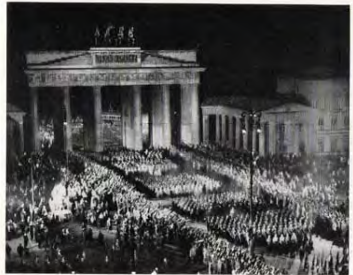
Berlin, January 30, 1937

On the same date, November 9, 1923, the General State Commissar issued an order dissolving the German National