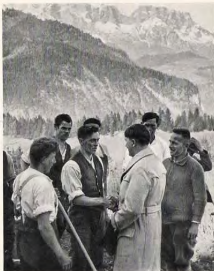
A HEARTY HANDSHAKE WITH THE WORKMEN

In his third electoral campaign, in which he used an aeroplane for purposes of rapid travel, Hitler was the central figure of the battle and went through the length and breadth of the country as a triumphant hero. Within a fortnight he spoke at 49 mass meetings. The electorate gave 13,700,000 votes for the National Socialist candidates, with the result that the latter now acquired