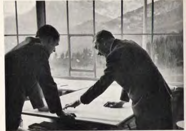
In Hitler's Studio at Obersalzberg

On March 23, 1933, the Führer asked for four years in which he could put into practice his measures for the restoration of the German nation. The law which gave him unlimited powers for this purpose was constitutionally passed by Parliament. After the expiry of this period, when he had given a public