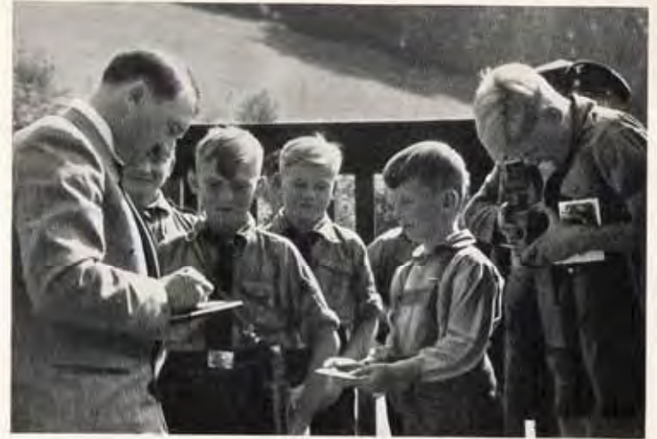
Some young Autograph Hunters.

The magnitude of the victory won on March 5 was unparalleled in German history. And it was as unexpected as it was unparalleled. 17,300,000 people cast their votes for Hitler,