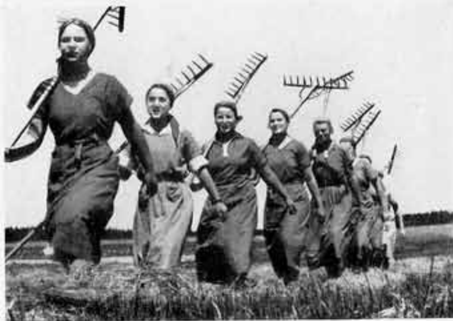
THEY'LL GET SOMETHING DONE Girls of the Land Year plan

organization for all students in the Reich). In this way the health and economic needs of the pupils in these institutions is cared for in a uniform manner. One day in the school week, Saturday, is placed at the disposal of the Fachschulschaften for the moral, physical and political training of their members. The education of the students in the ideals of National Socialism has been substituted for the one-time instruction in civics.