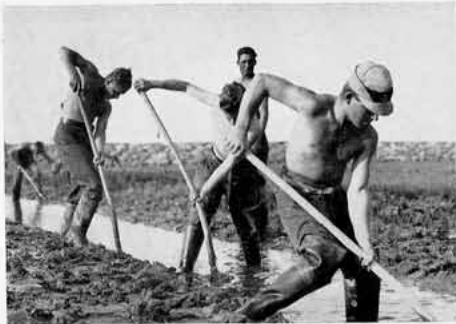
DIGGING IN Labour Service