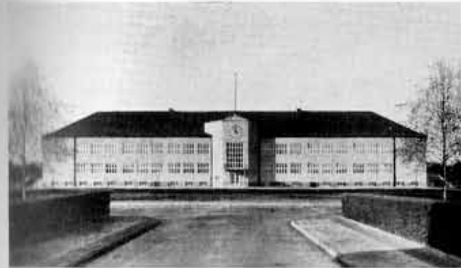
ONE OF THE MODERN ELEMENTARY SCHOOLS IN BERLIN

Elsewhere in Germany an attempt had already been made to raise this low-grade system of training for Elementary teachers to a much higher level. To do this three different lines of policy were pursued. The first method, adopted in states such as Hamburg, Saxony, Brunswick and Hessen, purposely transferred the training of elementary teachers to the University. The only difference between their training and that of the Secondary-school teachers was in the length of time put in. The Volksschul -teacher need remain only three years while the student training for a Secondary-school had to complete from 4 to 5 years at the University. According to the second scheme, tried out mainly in Thuringia (Jena), the Volksschul -teacher was sent for part of his time to the University where he received his purely academic training, and for the remainder of his course, to a completely separate institute.