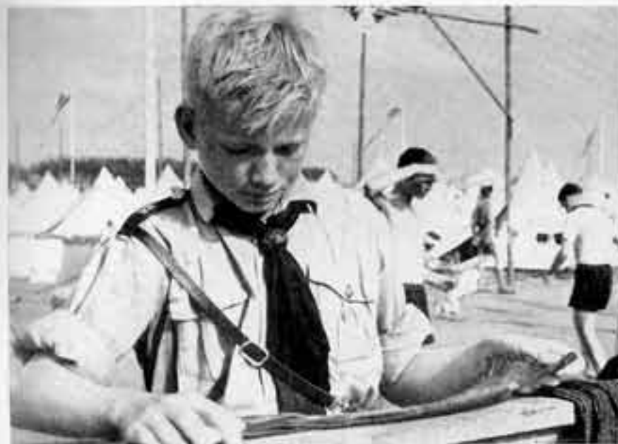
NOTHING DISTURBS THIS FELLOW Wash Day in a Camp

The four senior classes of the Volksschule have the twofold task of furthering the development of individuality and of imbuing the class as a whole with a consciousness of its German nationality. The curriculum is framed in accordance with these two aims. The instruction given depends on the age and general capacity of the pupils and seeks to develop the whole personality by way of the feelings and desires peculiar to childhood. The education so provided does not attempt to develop the faculties of memory and logical reasoning, but is based on the independent activity of the children themselves. Under the guidance of the teacher, knowledge is not merely transmitted, but is discovered by means of observation and independent experiment. Physical drill is included because it steels body and character and encourages voluntary obedience, self-control and efficiency.