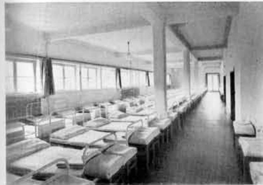
SUNNY DORMITORY Nationalpolitische Erziehungsanstalt Oranienstein