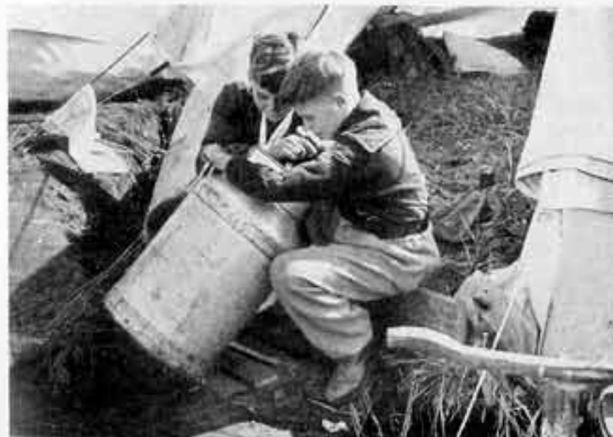
GOOD TO THE LAST DROP