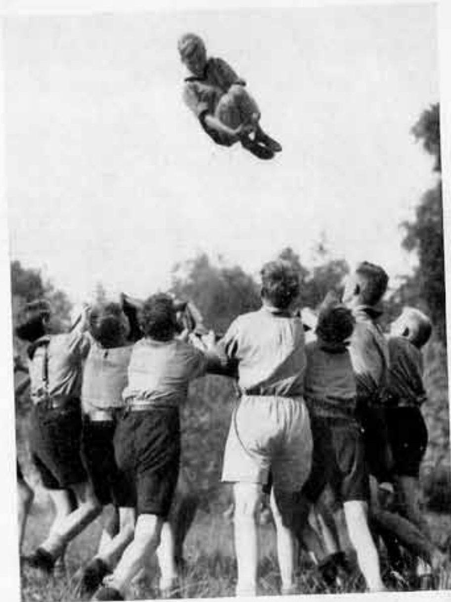
HOLD IT TIGHT, BOYS!

The subjects taught in the upper grade of the Volksschule include: religion, German, history and civics, the geography and history of the child's home-town or district, geography, biology, arithmetic, geometry, drawing, singing, gymnastics and, in the case of girls, needlework. The aim of the biology, geography and history-course is to introduce the pupil to the fundamental questions of ethnology, heredity, racial hygiene and genealogical study. When circumstances permit, these subjects are supplemented by manual work for the boys and domestic economy for the girls. The actual work set in the school is largely adapted to the special requirements of the district in which it is situated.