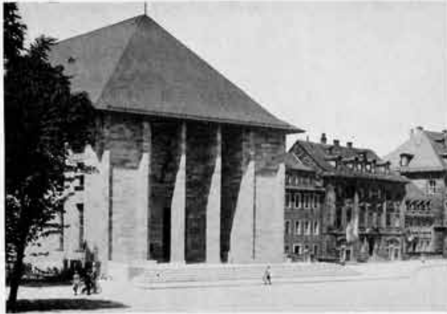
THE HOME OF THE GERMAN TEACHERS' ASSOCIATION Haus der Deutschen Erziehung, Bayreuth